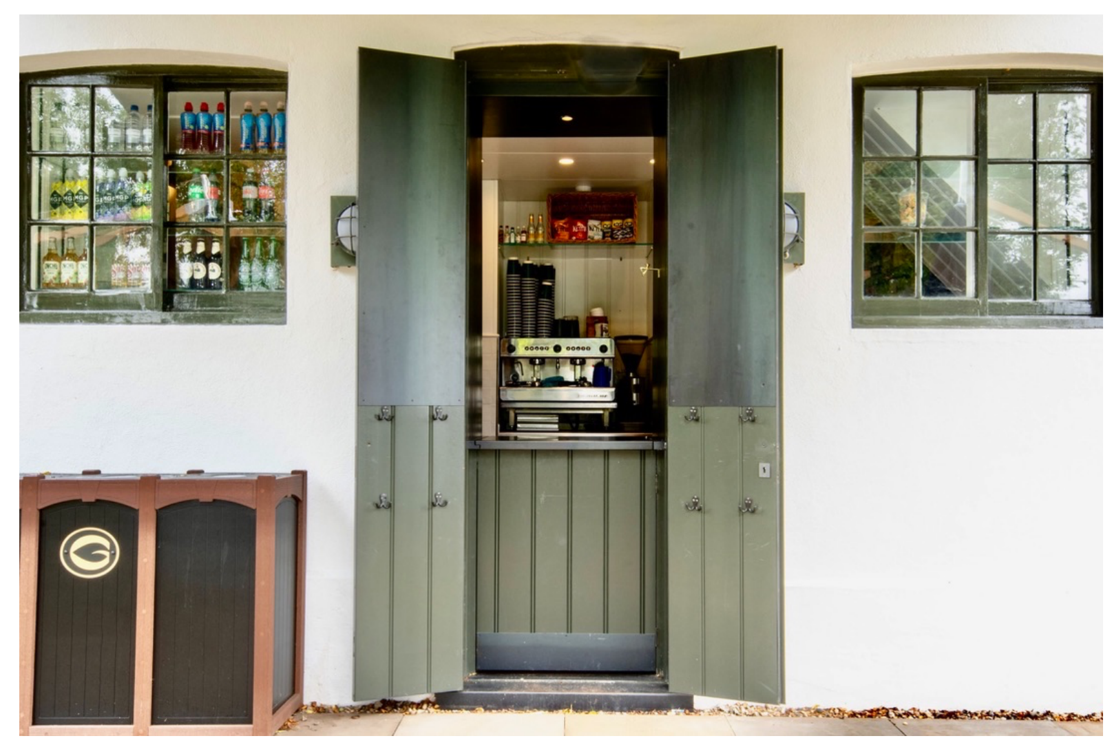
The Grove: The Stables Bar