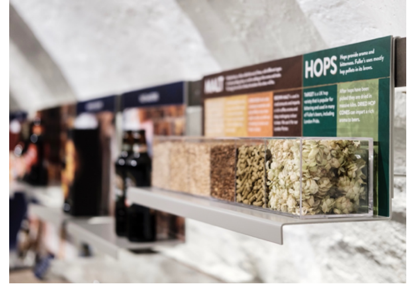
"An immersive brand experience bursting with expression"